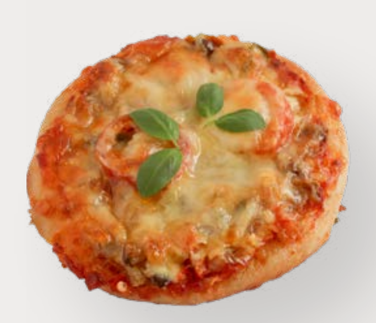
Vegetable Pizza Pizza with 5 kinds of vegetables & cheese on top Egg | Milk | Soy | Gluten