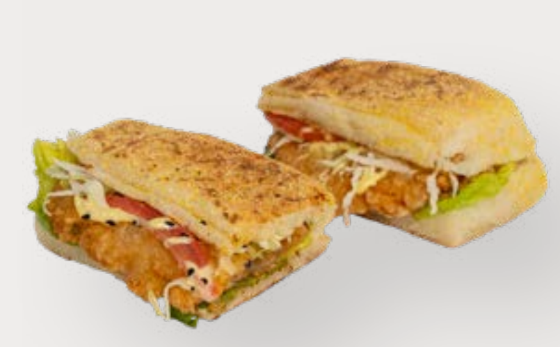
Chicken Panini Toasted panini with tender chicken breast, cabbage salad, cheddar cheese, & Japanese mayo Gluten | Egg | Dairy Soy | Sesame