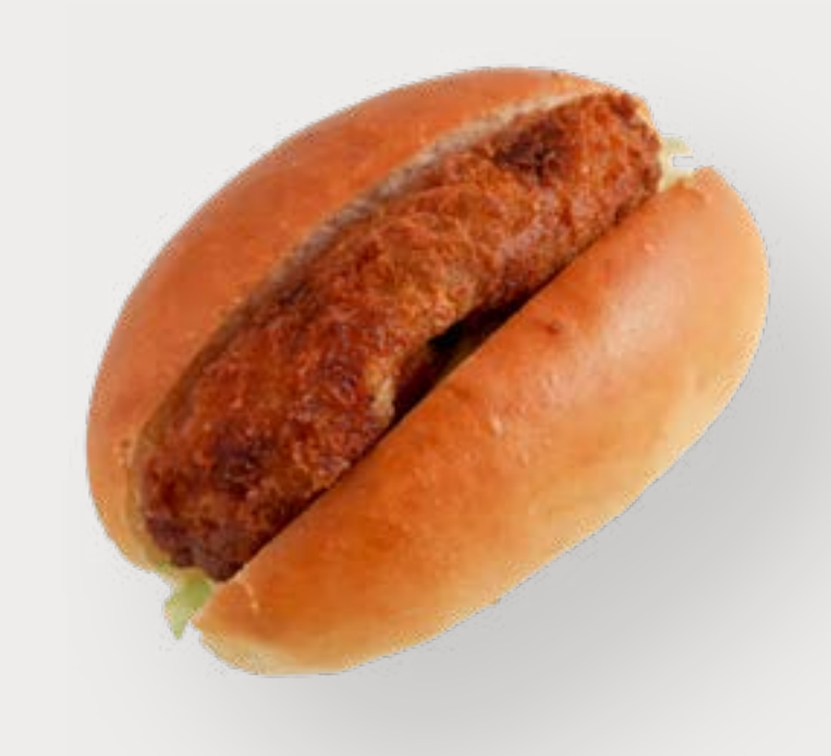
Croquette Bun Mashed potatoes &fried minced beef on a fluffy bun Egg | Milk | Soy | Gluten