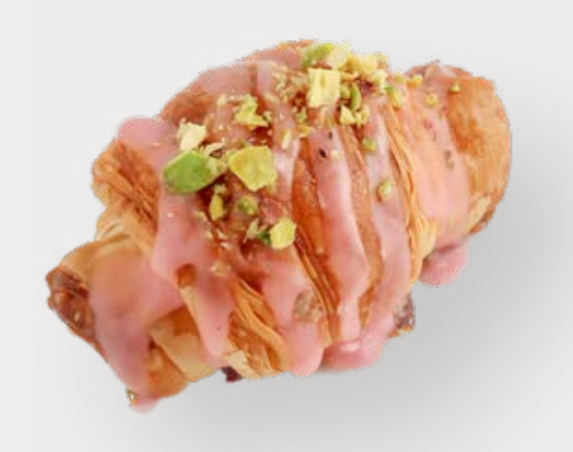
Rose Croissant croissant, strawberry filling & rose flavor icing Egg | Milk | Soy Almond Nuts | Pistachio Nuts