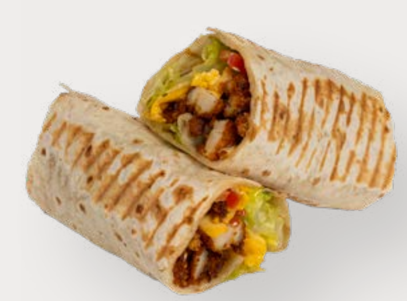
Chicken Wrap Tortilla with deep fried chicken, tomato & sriracha mayo

Gluten | Egg | Dairy Sulfite | Mustard | Soy