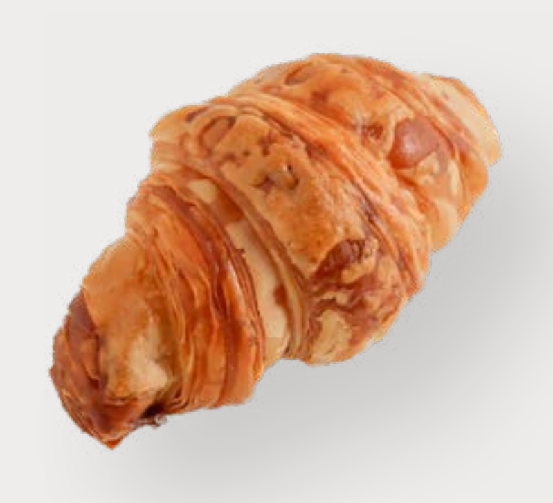
Chocolate Croissant Croissant with chocolate Plain Egg | Milk | Soy | Gluten