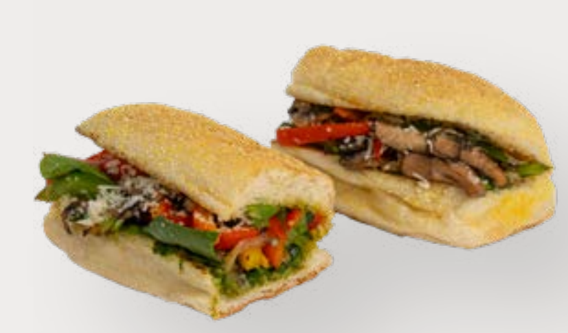
Vegetarian Roasted vegetable, cheese & pesto sauce Dairy | Gluten