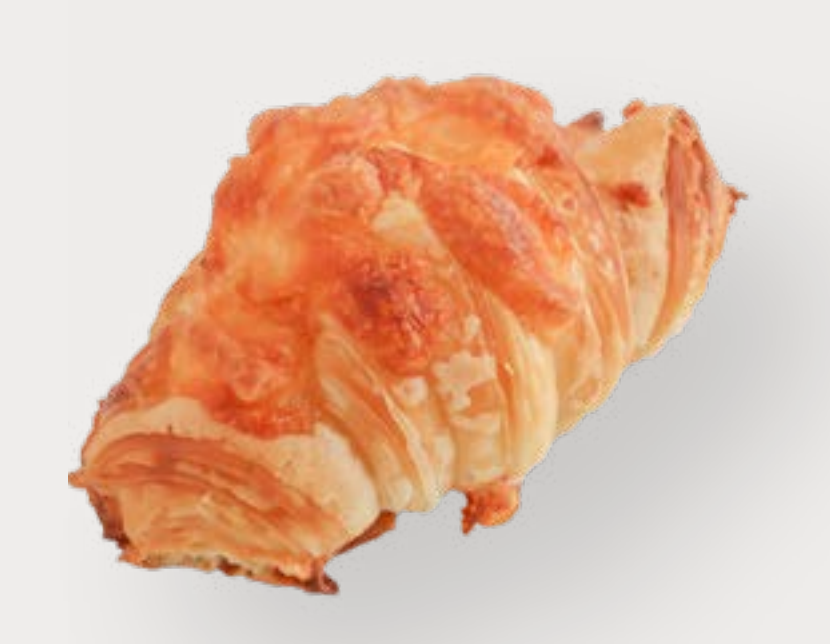
Cheese Croissant Croissant with cheese Egg | Milk | Soy | Gluten