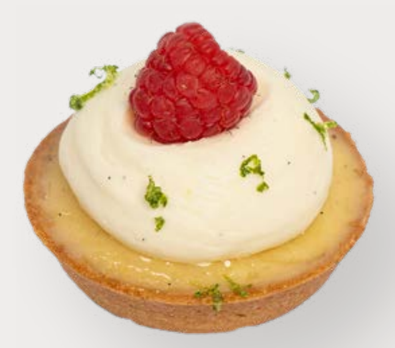
Yuzu Tart Crunchy pie filled yuzu light cream and vanilla cream Wheat | Gluten | Soy Egg | Milk | Almond