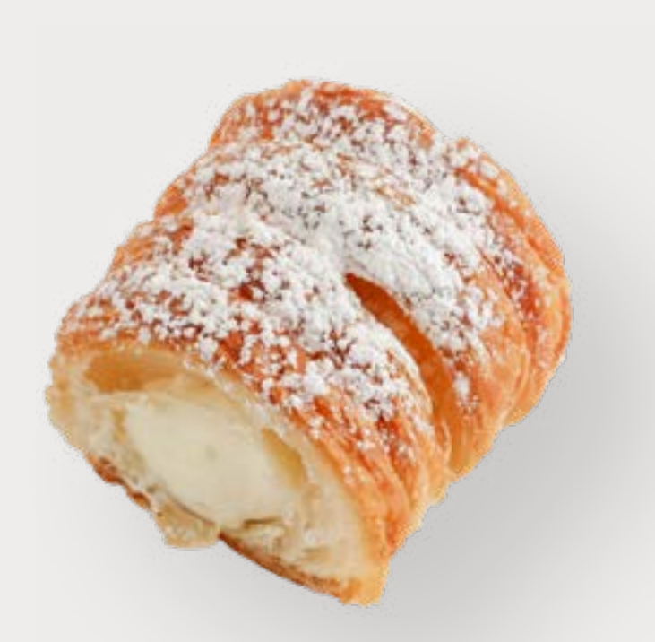
Custard Pie Roll filled with custard whipping cream Egg | Milk | Soy | Gluten