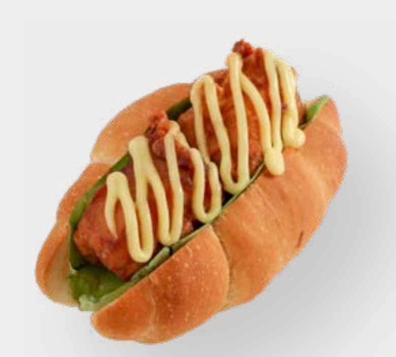
Chicken Karaage Bun Bun, lettuce leaves & chicken