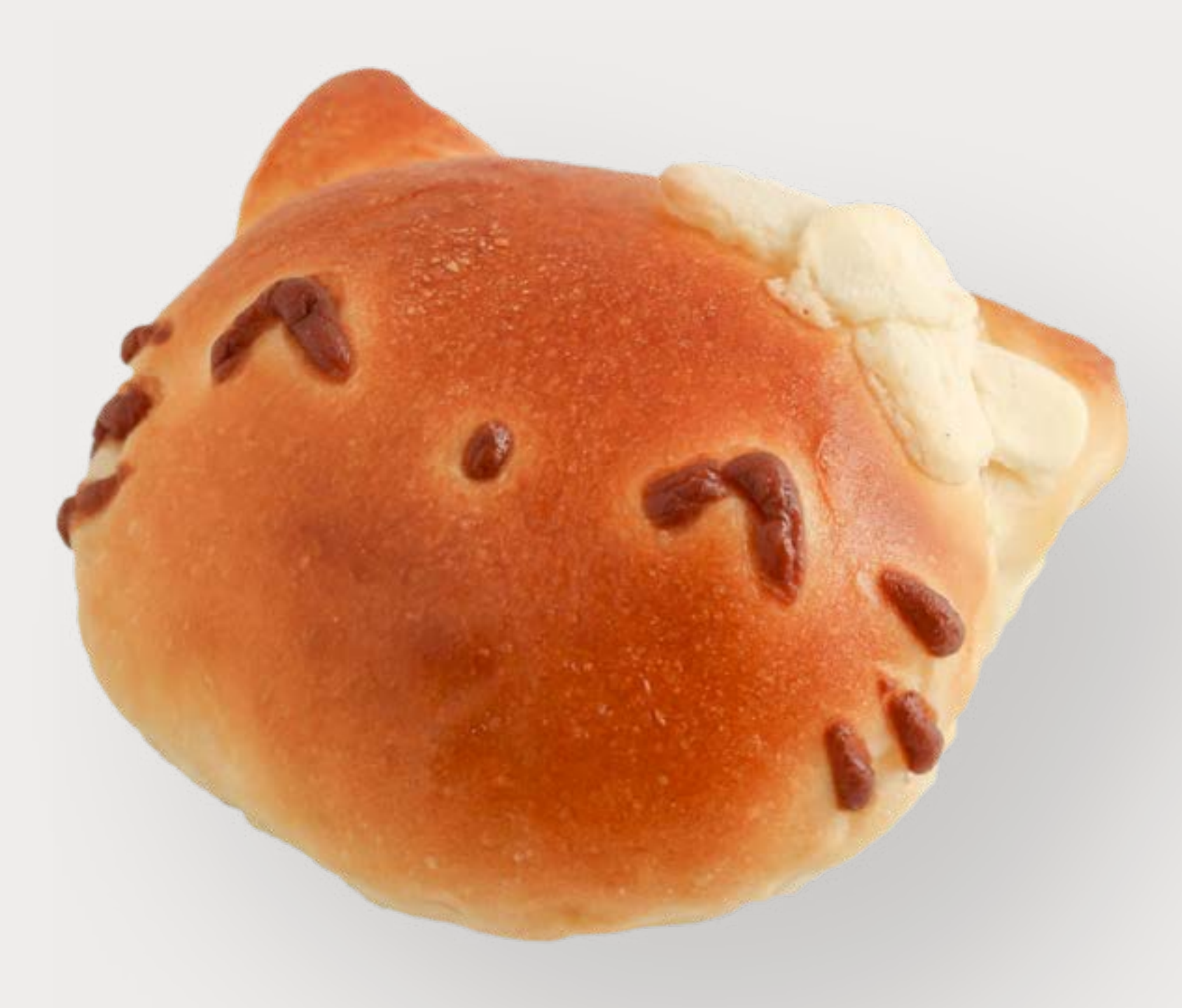
Kitty Nutella Sweet dough with Nutella filling Egg | Milk | Gluten Hazelnut | Soya