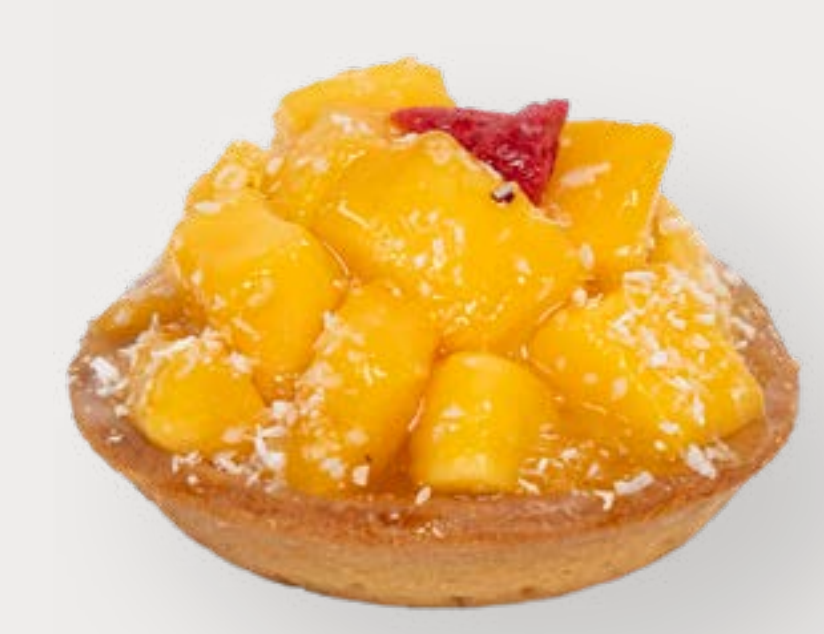
Mango Tart Crunchy pie filled custard cream and coconut topped cubes fresh mango mixed mango sauce Wheat | Gluten | Soy Egg | Milk | Almond