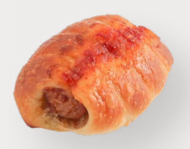
Beef Sausage A classic beef sausage roll with ketchup & Japanese mayo on top Egg | Milk | Soy Gluten | Celery