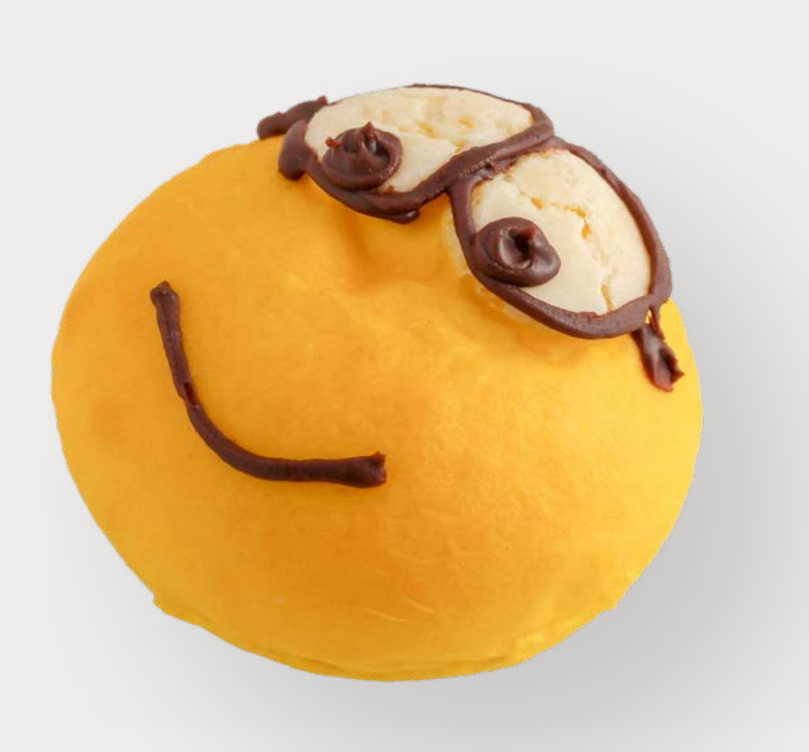
Minion Yellow dough with crunchy chocolate cream filling Egg | Milk | Soy Hazelnut | Gluten