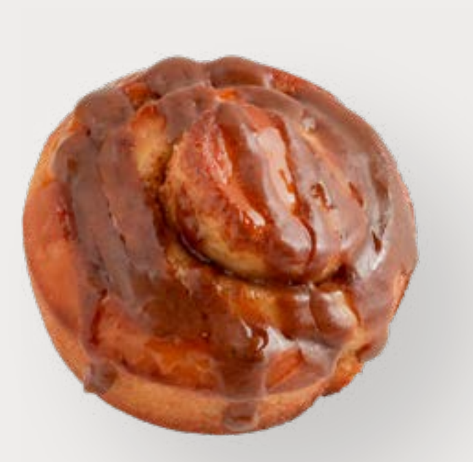
Cinnamon Roll Bun with cinnamon & custard cream Egg | Milk | Soy Gluten | Almond Nuts