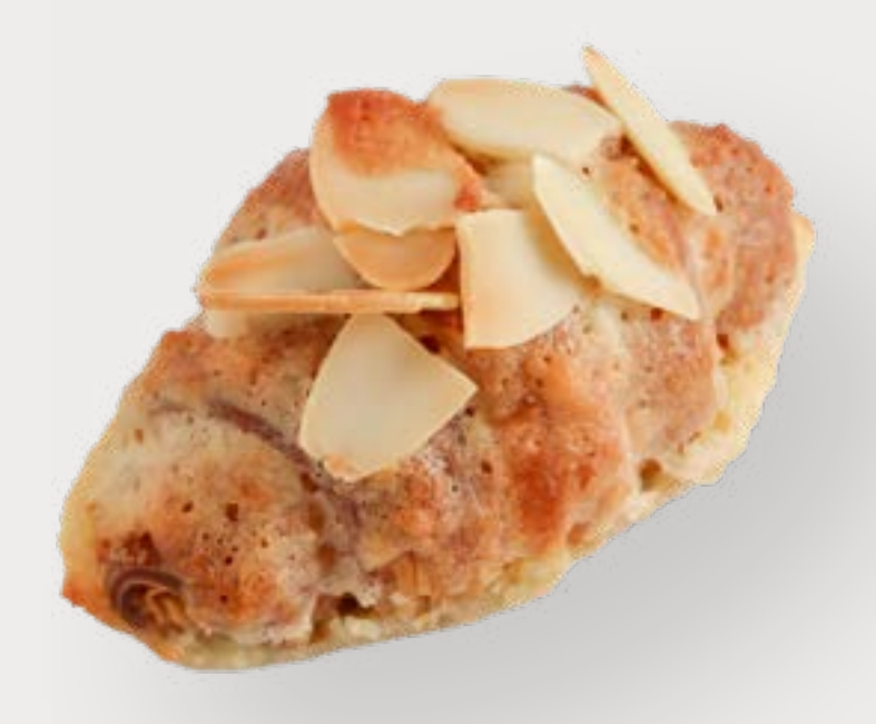
Almond Croissant Croissant with almond cream & almond slice Milk | Almond Nuts Egg | Soy | Gluten