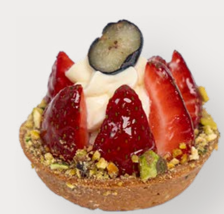
Strawberry Tart Crunchy pie filled vanilla cream and raspberry sauce topped fresh strawberry and pistachio nuts

Wheat | Gluten | Soy Egg | Milk | Almond Pistachio