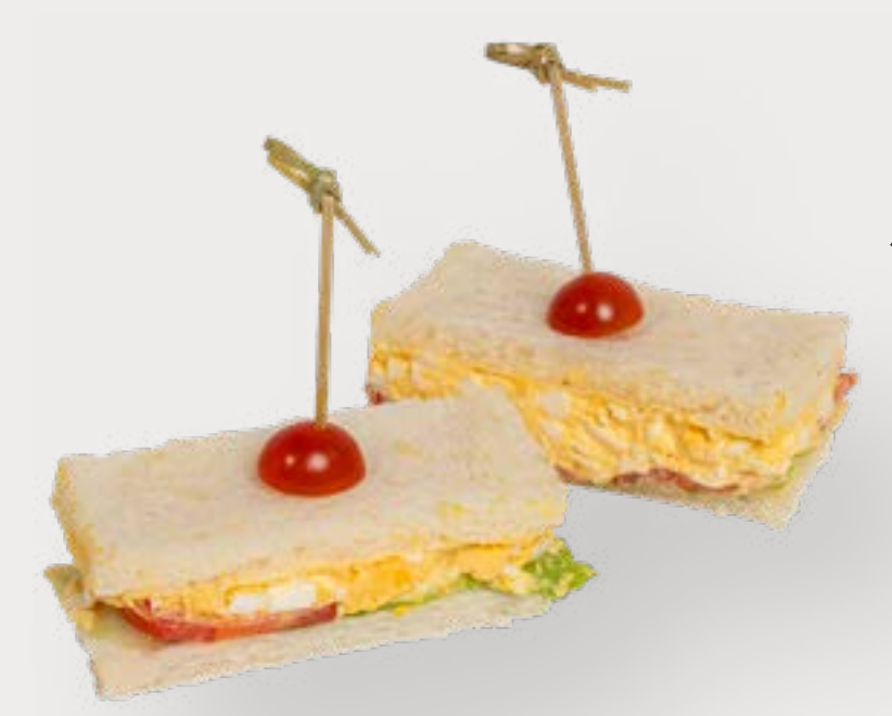
Japanese Egg Egg & japanese mayo Wheat | Gluten | Milk Egg | Mustard