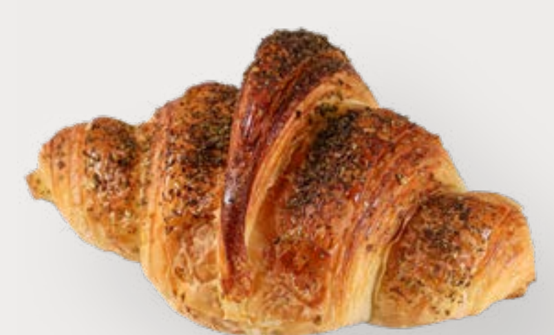
Zaatar Croissant Croissant with zaatar inside & on top Egg | Milk | Soy | Gluten