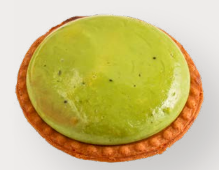
Matcha Tart Sweet shortcrust pastry tart filled with matcha, cream, & cheese Wheat | Gluten | Egg | Milk