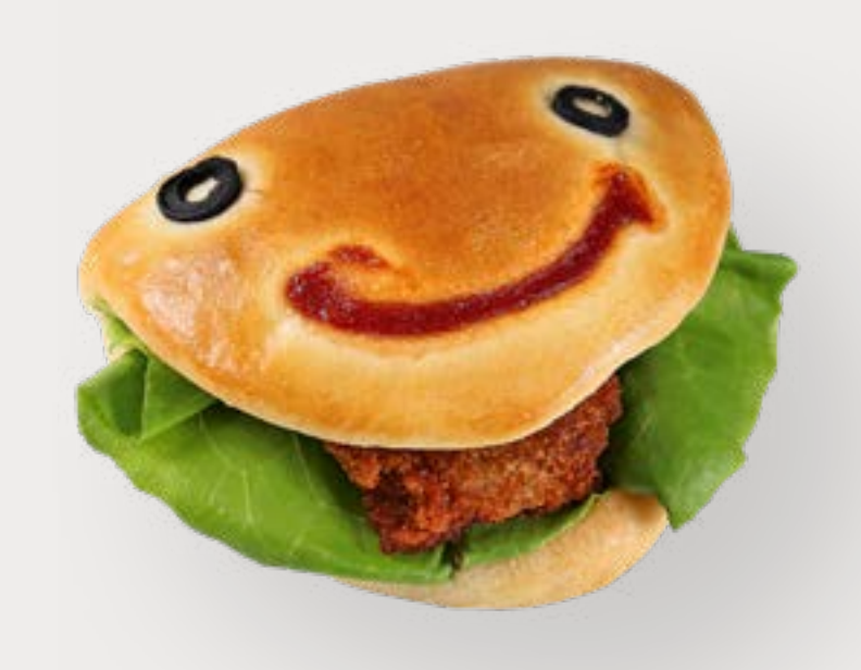
Happy Face Minced beef patty fried with a smiley burger bun Egg | Milk | Soy Gluten | Celery