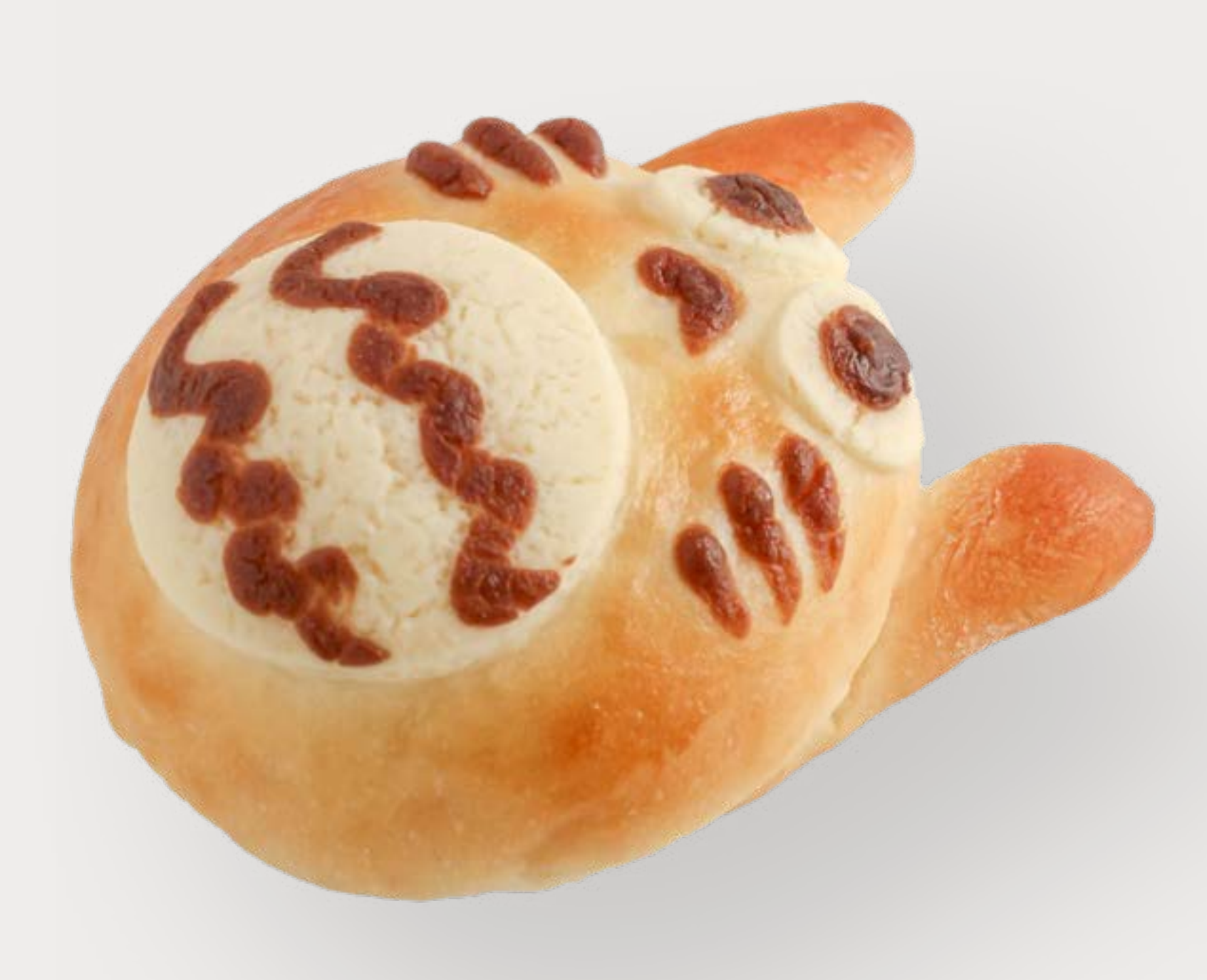
Totoro Sweet dough with chocolate custard filling