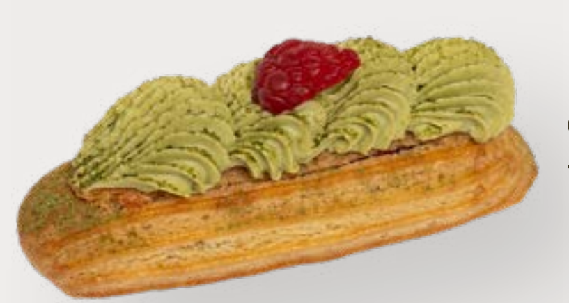
Éclair Matcha Raspberry eclair dough filled matcha tiramisu cream and raspberry sauce

Wheat | Gluten | Soy Egg | Milk | Almond Pistachio