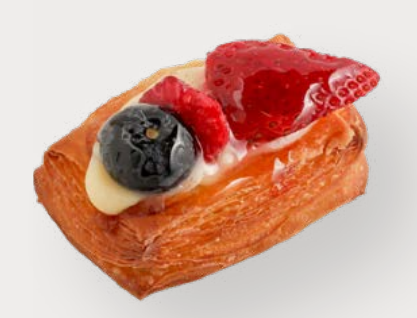
Red Fruit Bar Croissant with custard, almond cream & 3 kinds of fresh fruits Egg | Milk | Soy Gluten | Almond Nuts