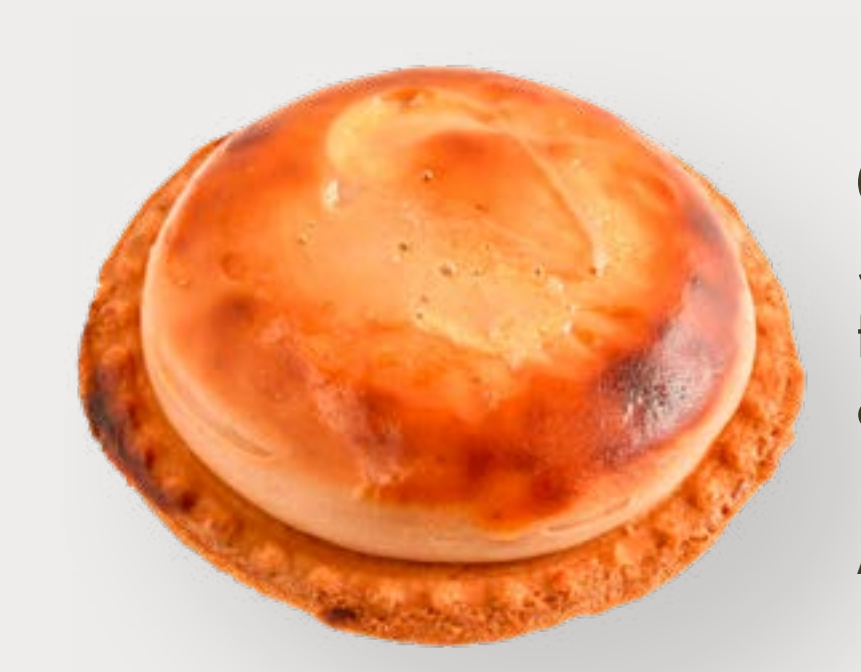
Chocolate Tart Sweet shortcrust pastry tart filled with chocolate, cream & cheese Wheat | Gluten | Egg Milk | Hazelnut | Soy