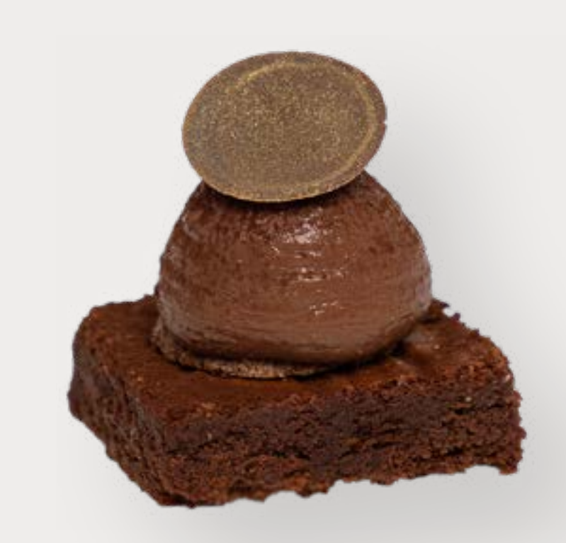
Mini Chocolate Brownie Moist chocolate brownie topped dark chocolate cream and cocoa powder Wheat | Gluten | Soy Egg | Milk