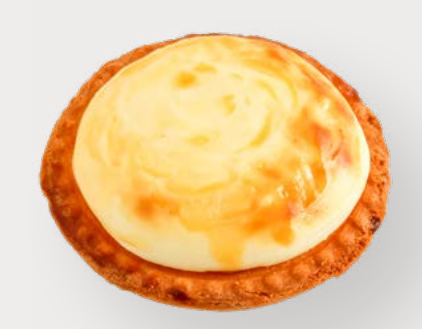
Cheese Tart Sweet shortcrust pastry tart filled with creamy cheese Wheat | Gluten | Egg Milk | Cheese