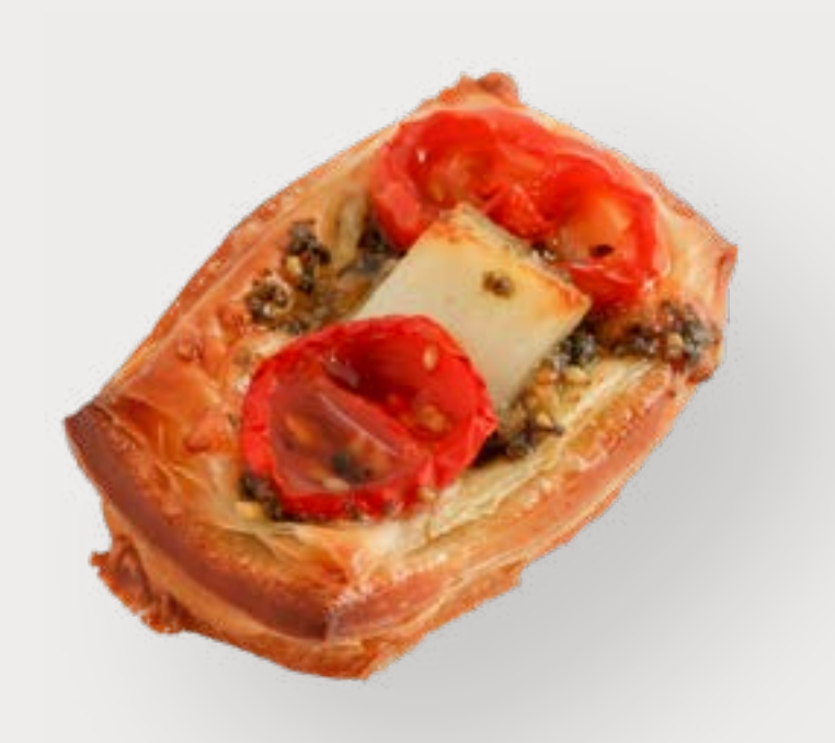
Halloumi Bar Croissant with zaatar, halloumi cheese & cherry tomato Egg | Milk | Soy | Gluten