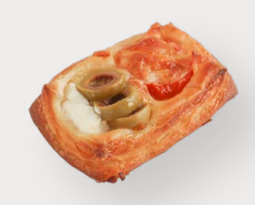
Feta & Olive Croissant with feta cheese, green onions & tomato Egg | Milk | Soy | Gluten