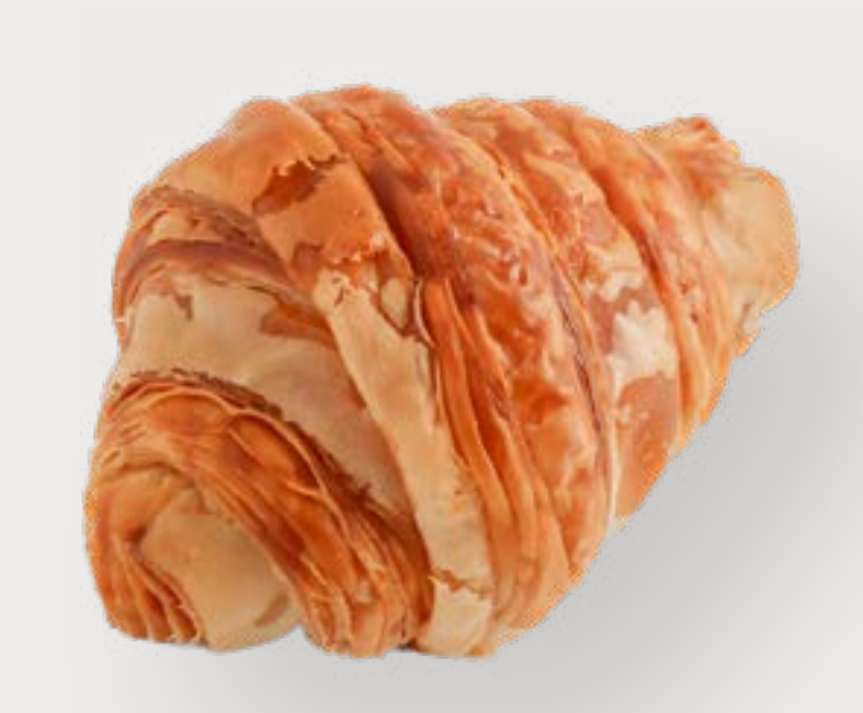
Plain Croissant Plain Croissant with first class butter & selected ingredient Egg | Milk | Soy | Gluten