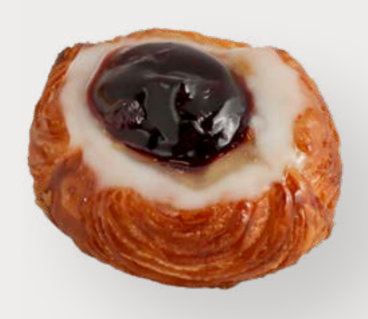
Blueberry Croissant Croissant with custard & blueberry jam Egg | Milk | Soy | Gluten