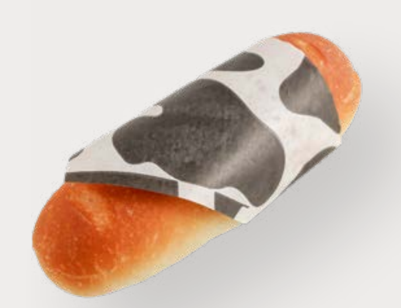
Milky Bun Sweet dough with condensed milk base & cream inside