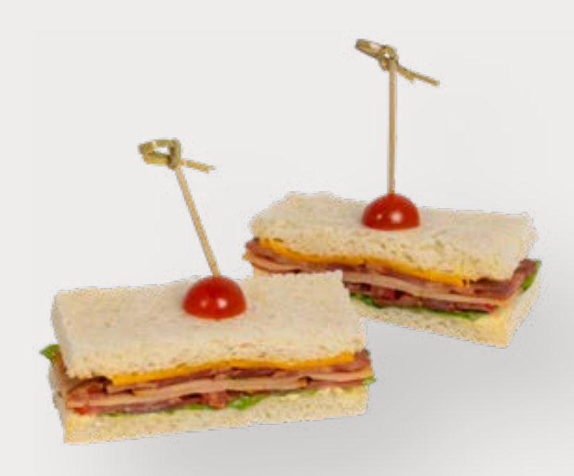
BLT Turkey bacon, lettuce, tomato & cheese Wheat | Gluten | Milk Fish | Egg