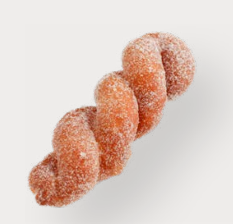
Twisted Doughnut Simple doughnut with sugar Egg | Milk | Soy | Gluten