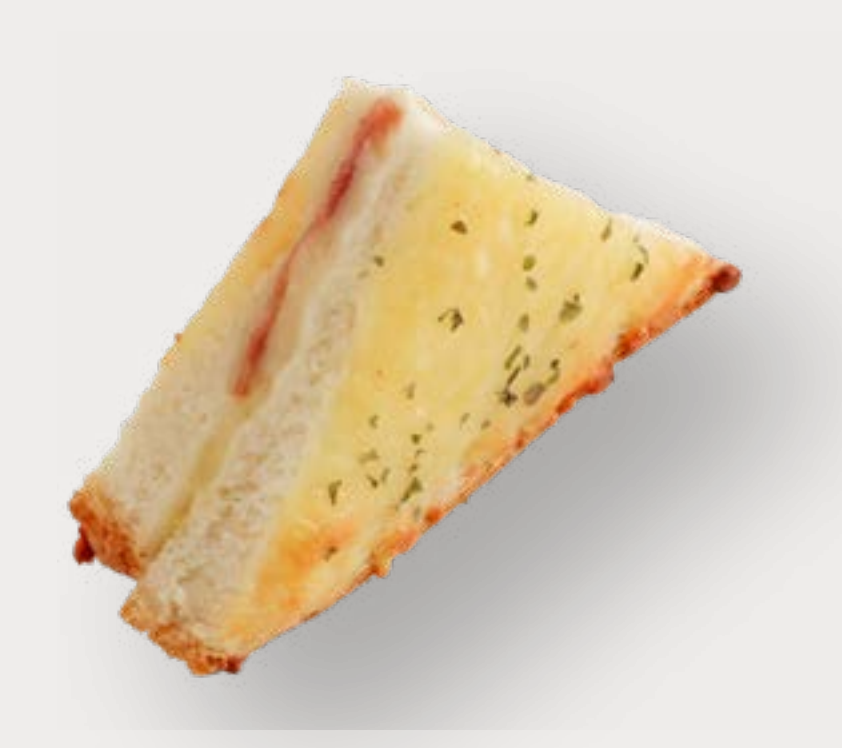
Croque Monsieur Toast with turkey ham, béchamel sauce & cheese toast