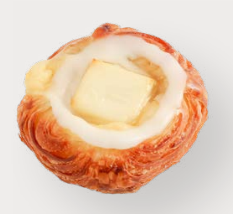
Yamanote Croissant croissant, cream cheese & custard cream Wheat | Gluten | Milk | Egg